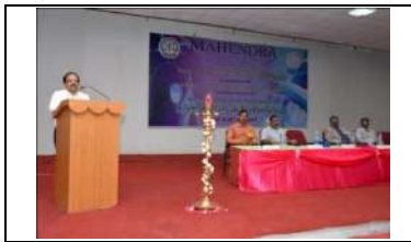
(Day-1 Key note Address)