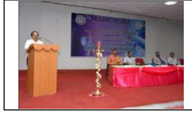
(Day-1 Key note Address)