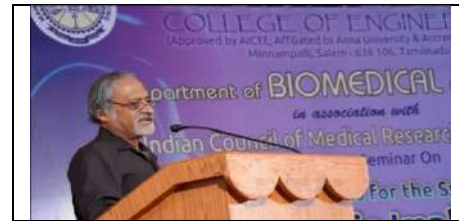
(Day-2 Key note Address)