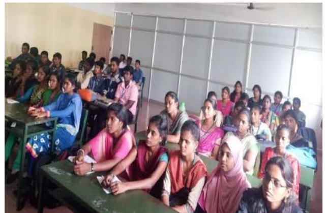
Campus Connect Webinar on “IoT Platform” on 29 th Aug 2017 at Mahendra College of Engineering, Salem