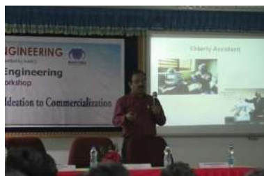
(Day 4 key note address)