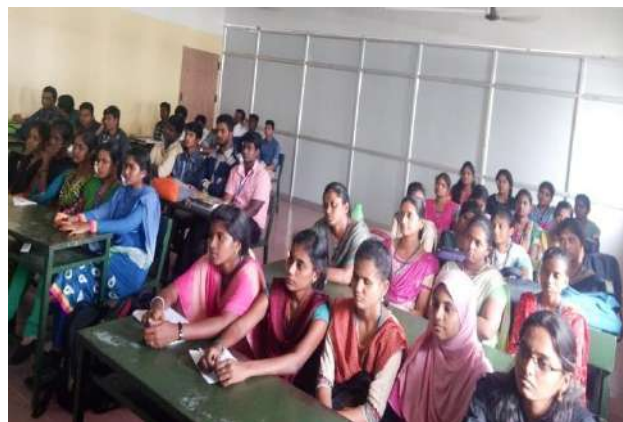
Campus Connect Webinar on “IoT Platform” on 29 th Aug 2017 at Mahendra College of Engineering, Salem