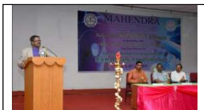
(Day-1 Presidential Address)