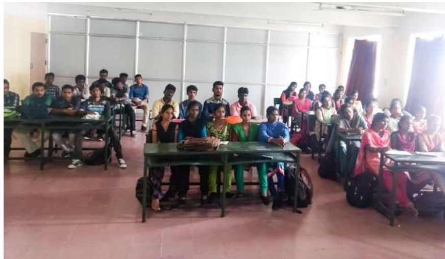
Campus Connect Webinar on “LPWA communication technologies” on 8 th September 2017 at Mahendra College of Engineering, Salem