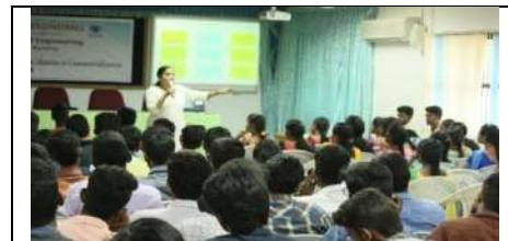
(Day3 key note address)