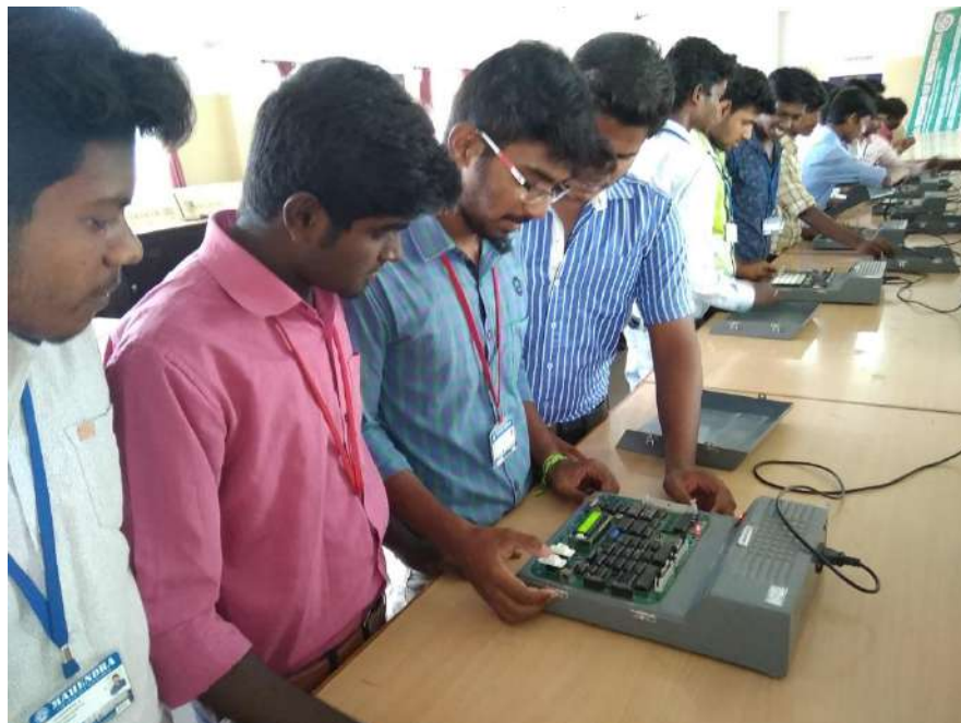
The students were practicing with microprocessor during the workshop.