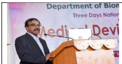
(Day 1 key note address)