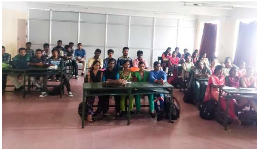
Campus Connect Webinar on “LPWA communication technologies” on 8 th September 2017 at Mahendra College of Engineering, Salem