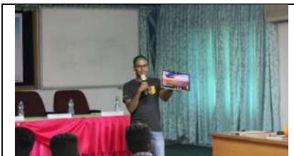
(Day 2 key note address)