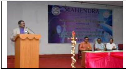
(Day-1 Presidential Address)