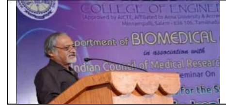
(Day-2 Key note Address)